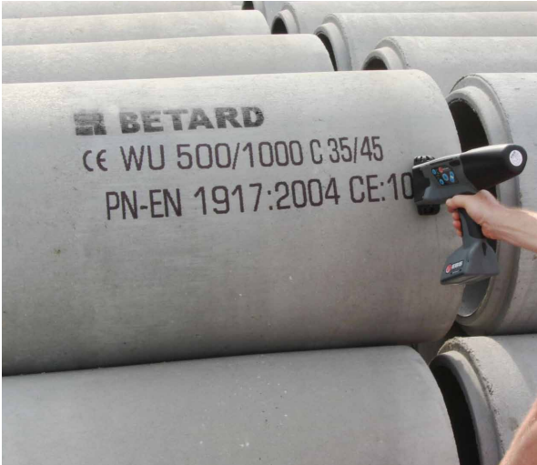
Prints on concrete with special UV-resistant black ink