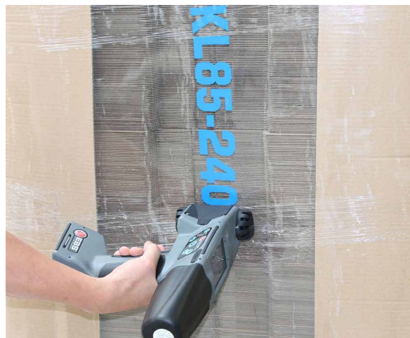
Prints on stretch wrap with pigmented ink

In addition, the HandJet EBS-260 makes available a number of practical accessories to maximize the function of the unit. These include print stabilizers, guide wheels, scanners, handy carry bags and holsters, and a growing number of added options.