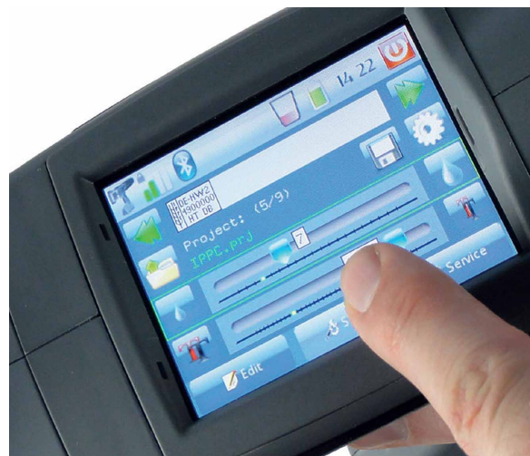
Control and input via touchscreen

For more information on the reimagined HandJet EBS-260, contact EBS Ink-Jet Systems at 847-996-0739 or america@ebs-inkjet.com .