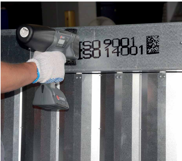
Prints on steel with black universal ink

EBS Ink-Jet revolutionized hand-held coding when we introduced the HandJet EBS-250. Now our next-generation HandJet EBS-260 model provides reimagined features and functionality for even more innovative, portable coding.