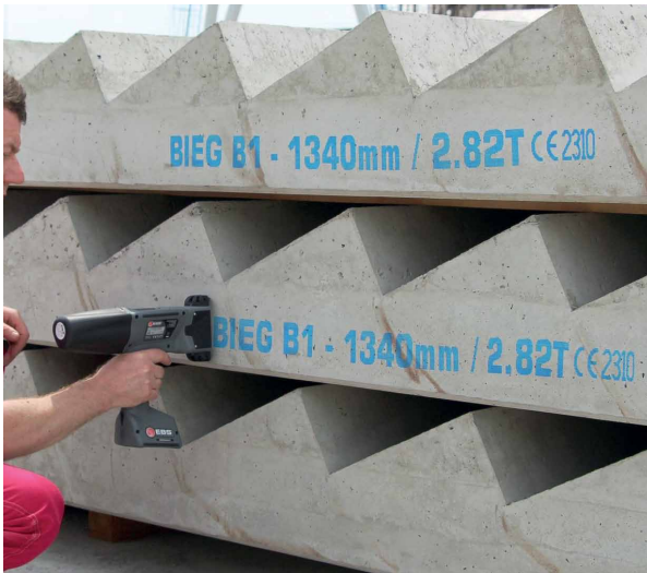
Also prints on concrete with blue pigmented ink